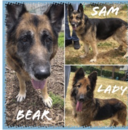
A home run for these three from the Oakland shelter

Most likely an outdoor dog all his life, once in his foster home, he truly thrived, savoring every precious meal and outing with the pack. His personality also began to shine, revealing a beautiful spirit so very deserving of a second chance in his golden years. Bobby was recently adopted and is now a beloved member of a great family.