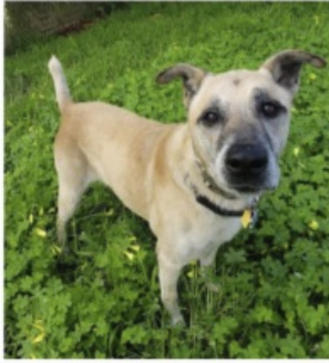
Bobby now enjoys the finer things in life like a cool romp in the grass and his own family!

Just in the nick of time, Bobby was rescued and rushed to the vet, where he spent the next couple of weeks getting the medical attention he desperately needed: a full blood panel, wound and ear treatments, and neutering. Slowly he began to heal and gain weight.