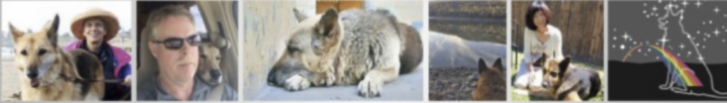
TSGSR ... a legacy of helping the most vulnerable